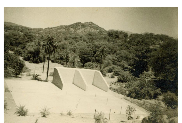
Hand Ball and Tennis Courts - Plummy in the Background