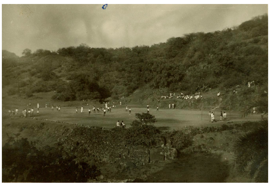
Class Hockey Tournament on the Big Pitch Now Under Water