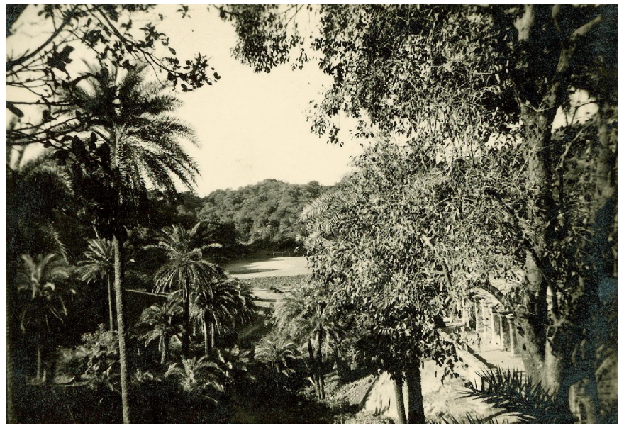
Big Pitch (Now Under Water) Taken from Back of Jr. Dormitory – Servant's Quarters