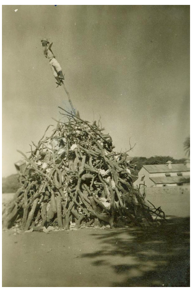
Bon Fire Logs Collected by Pre Seniors Piled Up High for Last Night In School

As it began drizzling lightly we had to move indoors. We eventually went to bed at around 9:30 pm.